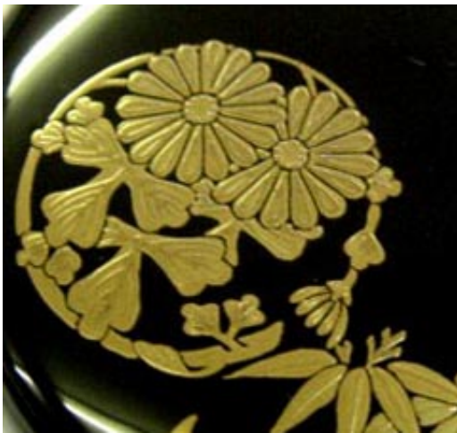
Hira Makie (flat makie)

a technique for which a painted design is applied at the time of the middle lacquer, on top of which urushi is layered. Then the entire surface is polished so that the painted design floats into view. Said to be the origin of makie.