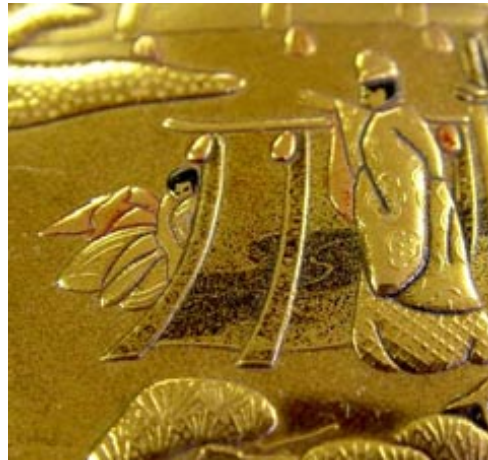
Taka Makie (relief makie)