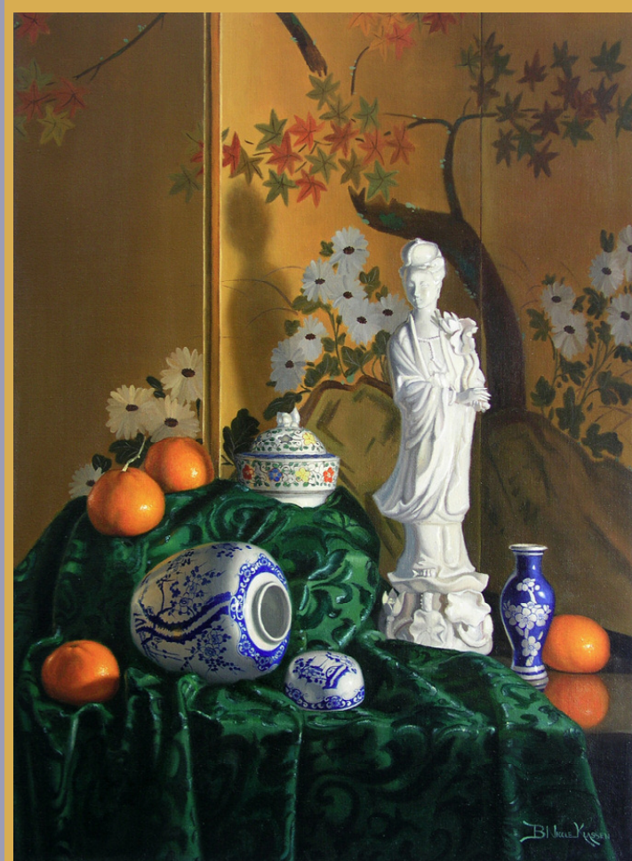
Harmony in Orange and Blue