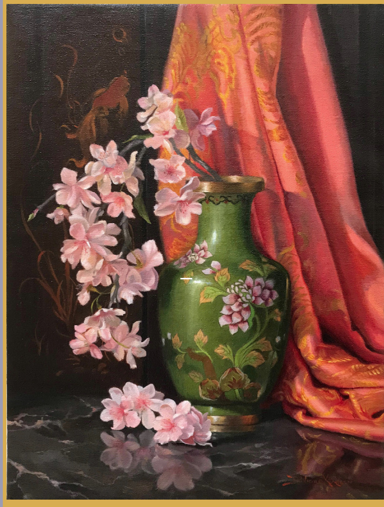
Spring Cascade 16 x 12