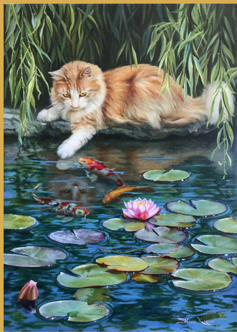
The Encounter 24 x 18