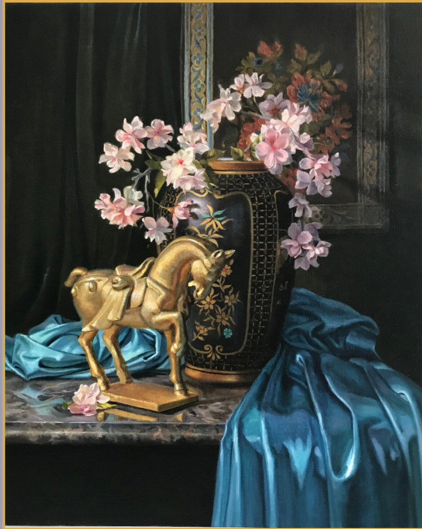
The Golden Horse 20 x 16