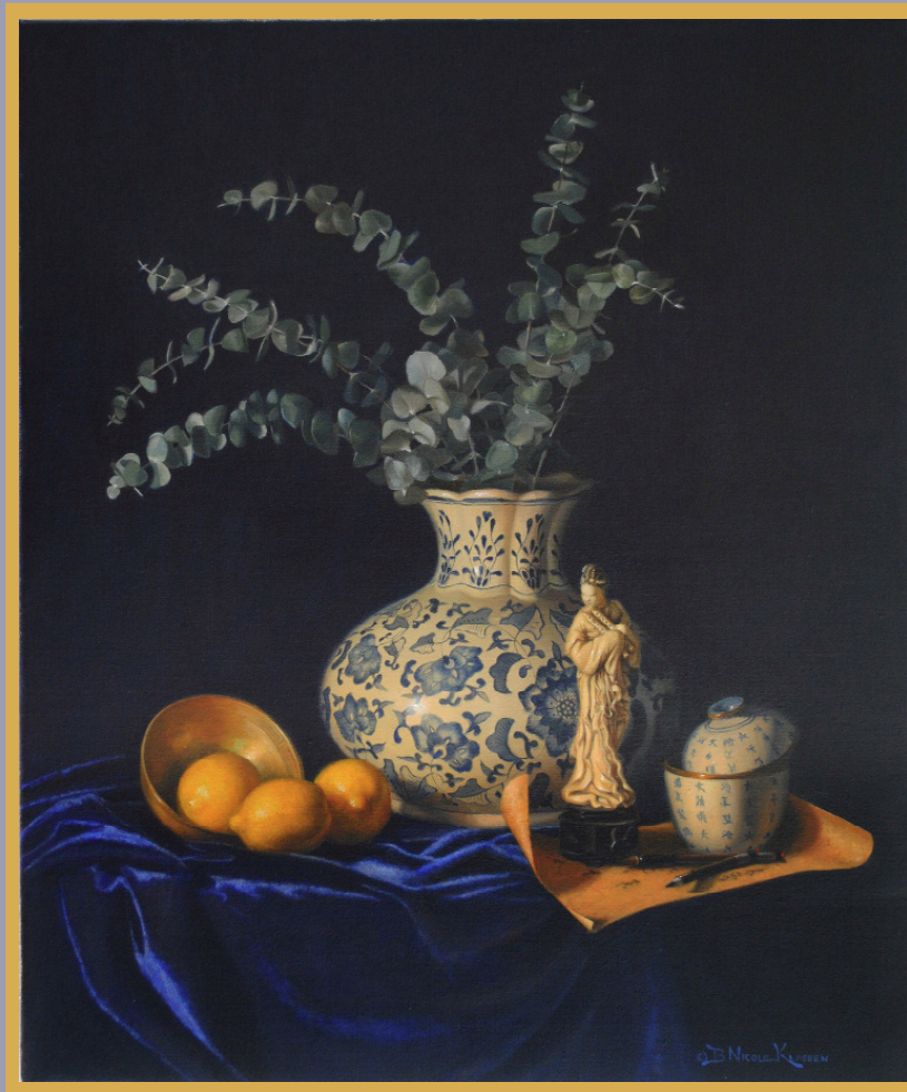
Blue Velvet 24 x 20