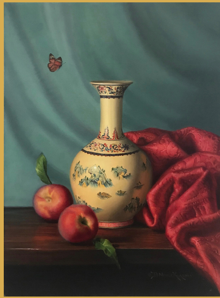
Sky and Earth 16 x 12