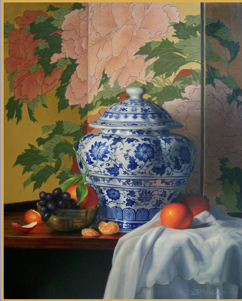
Temple Jar with Fruit