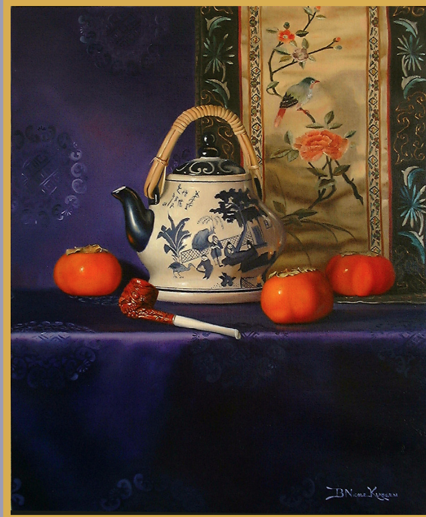
Japanese Persimmons 20 x 16