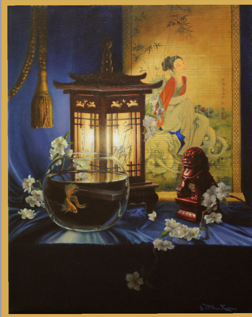
Shoji Lantern 20 x 16