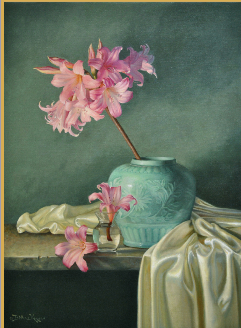
Belladonnas 24 x 18